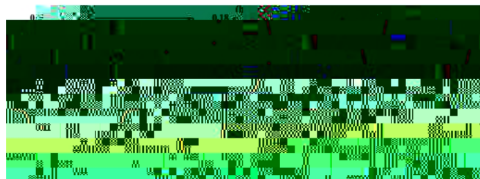
FIG. 3. Band structures and effective parameters of the 2D metafluid with a hexagonal lattice.